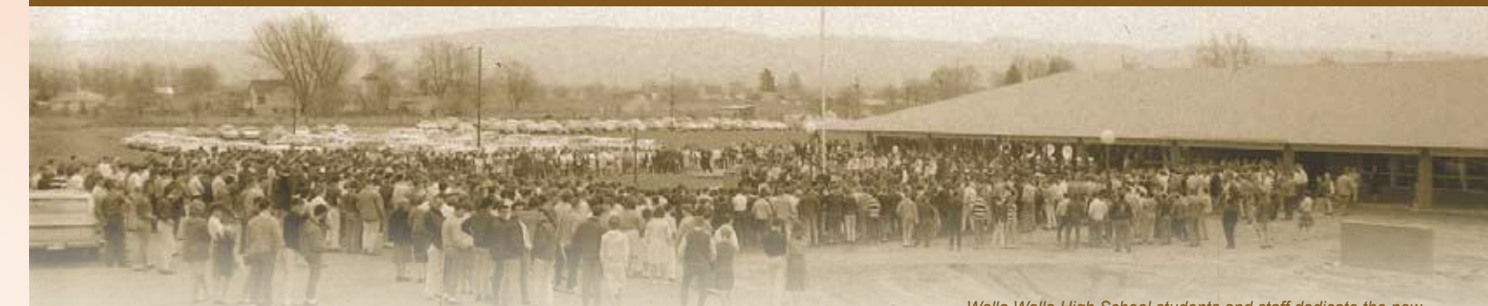
Walla Walla High School students and staff dedicate the new flagpole as the school opens during the 1963-64 school year.

VERSIÓN EN ESPAÑOL DISPONIBLE EN EL SITIO WEB DEL DISTRITO -- WWW.WWPS.ORG