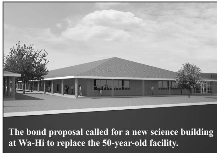
The bond proposal called for a new science building at Wa-Hi to replace the 50-year-old facility.

Rejected Votes: 4,234 • Final Percentage No: 47.51%