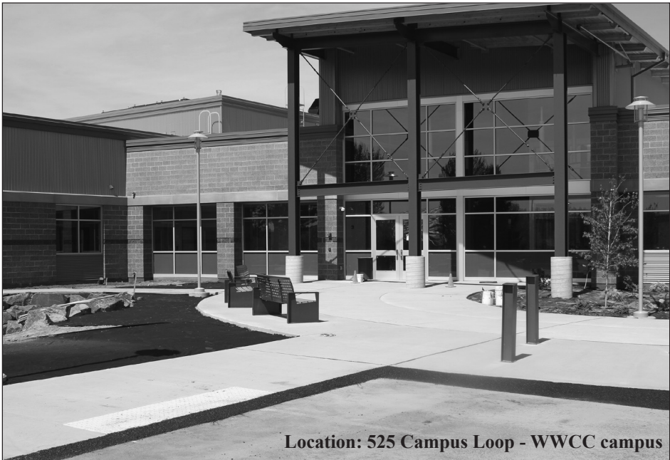
Location: 525 Campus Loop - WWCC campus