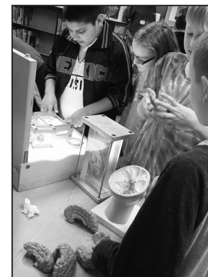
Students studied real organs from both humans and animals.

The Science on Wheels programs are aligned with Washington state learning standards.