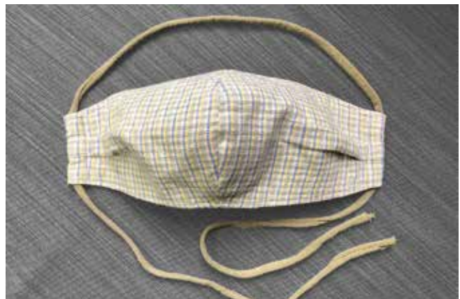
Examples of cloth face coverings for use during low-risk work.